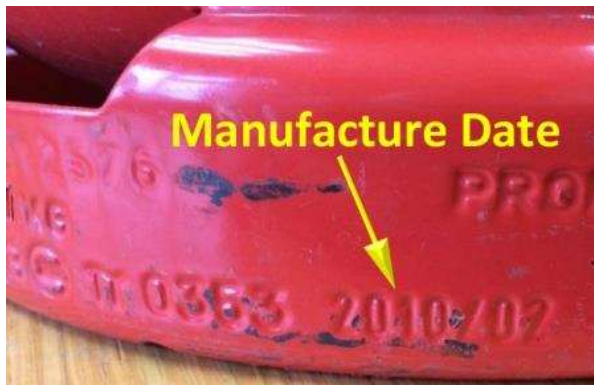
Illustration shows manufacture date of 2010 (i.e. AP 10 B)

At the very bottom of the base ring the third row of text shows the date of manufacture i.e. 2008, 2009, 2010 or 2011.